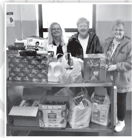
Our Savior's Lutheran Church donated care packages to our Veterans. So caring!