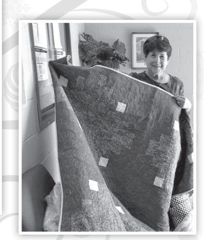
Awesome quilts from Blessed Sacrament. True works of art!