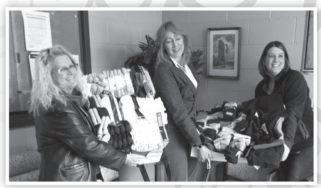
RSVP+ donated socks & sweats to our Veterans for National Make A Difference Day. Thanks to our retired friends!